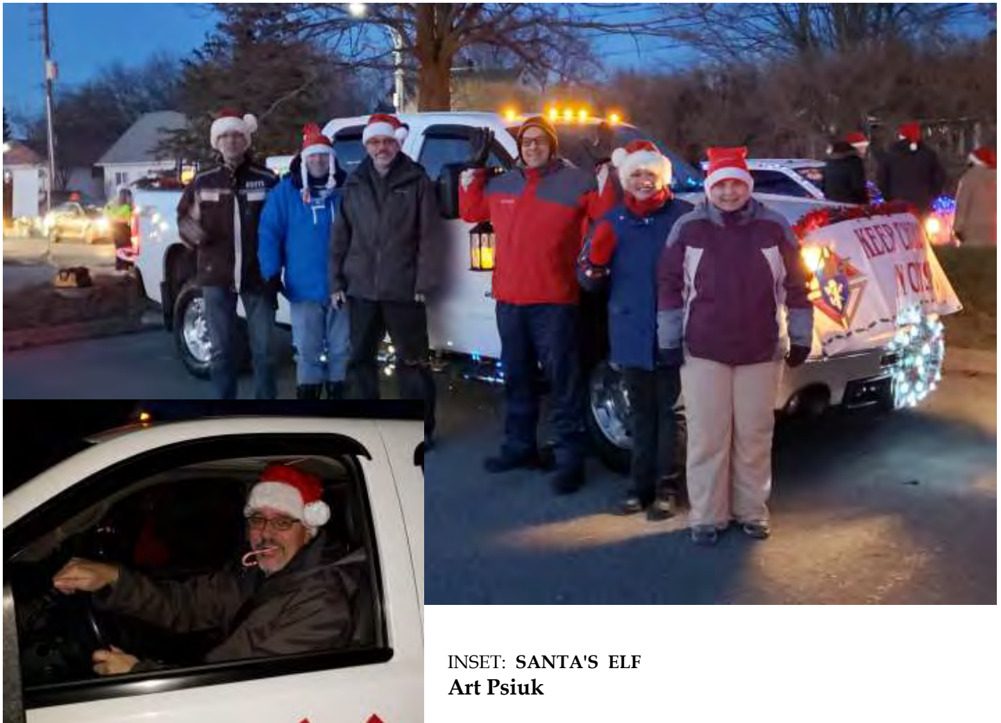
INSET: SANTA'S ELF Art Psiuk