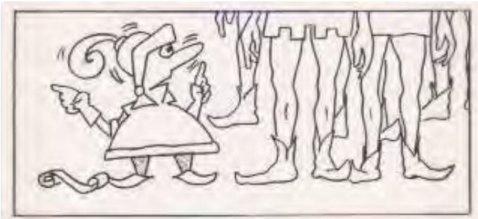
ER ... I JUST REMEMBERED I HAVE SOMETHING ELSE TO DO ... BYE