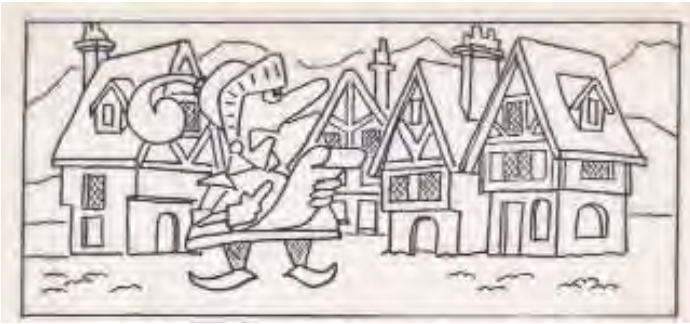
HEARRR YEEEE! BRING FORTH THE SQUIRE CANDIDATES